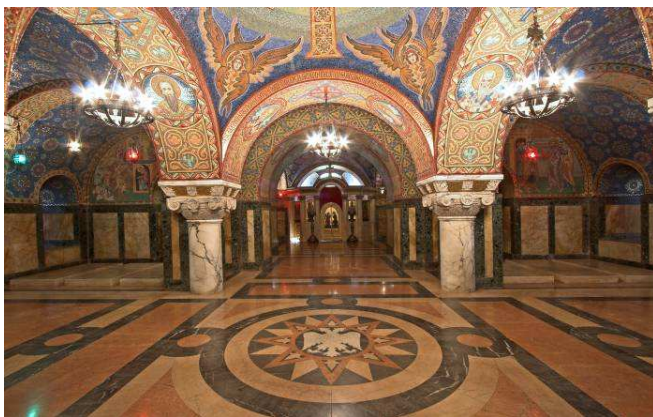
Saint George Church