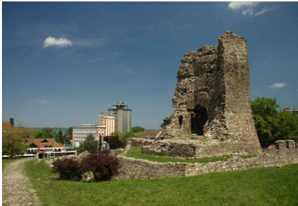
Old Lazar's town